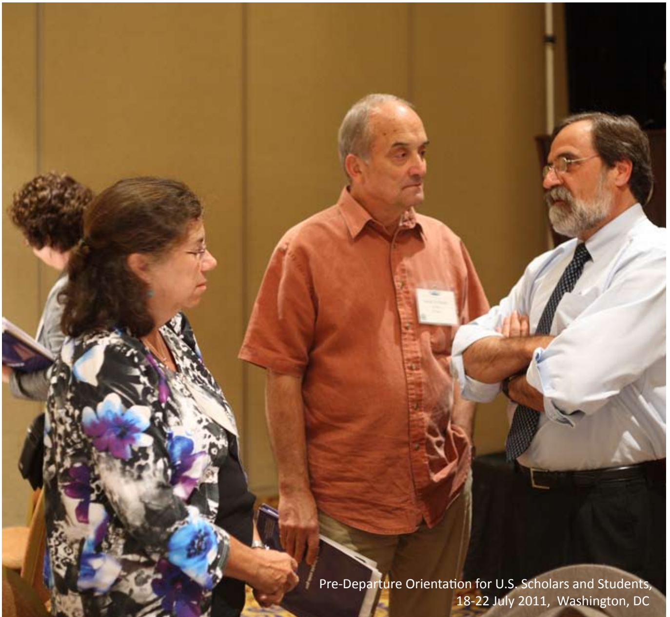
Pre-Departure Orientation for U.S. Scholars and Students, 18-22 July 2011, Washington, DC