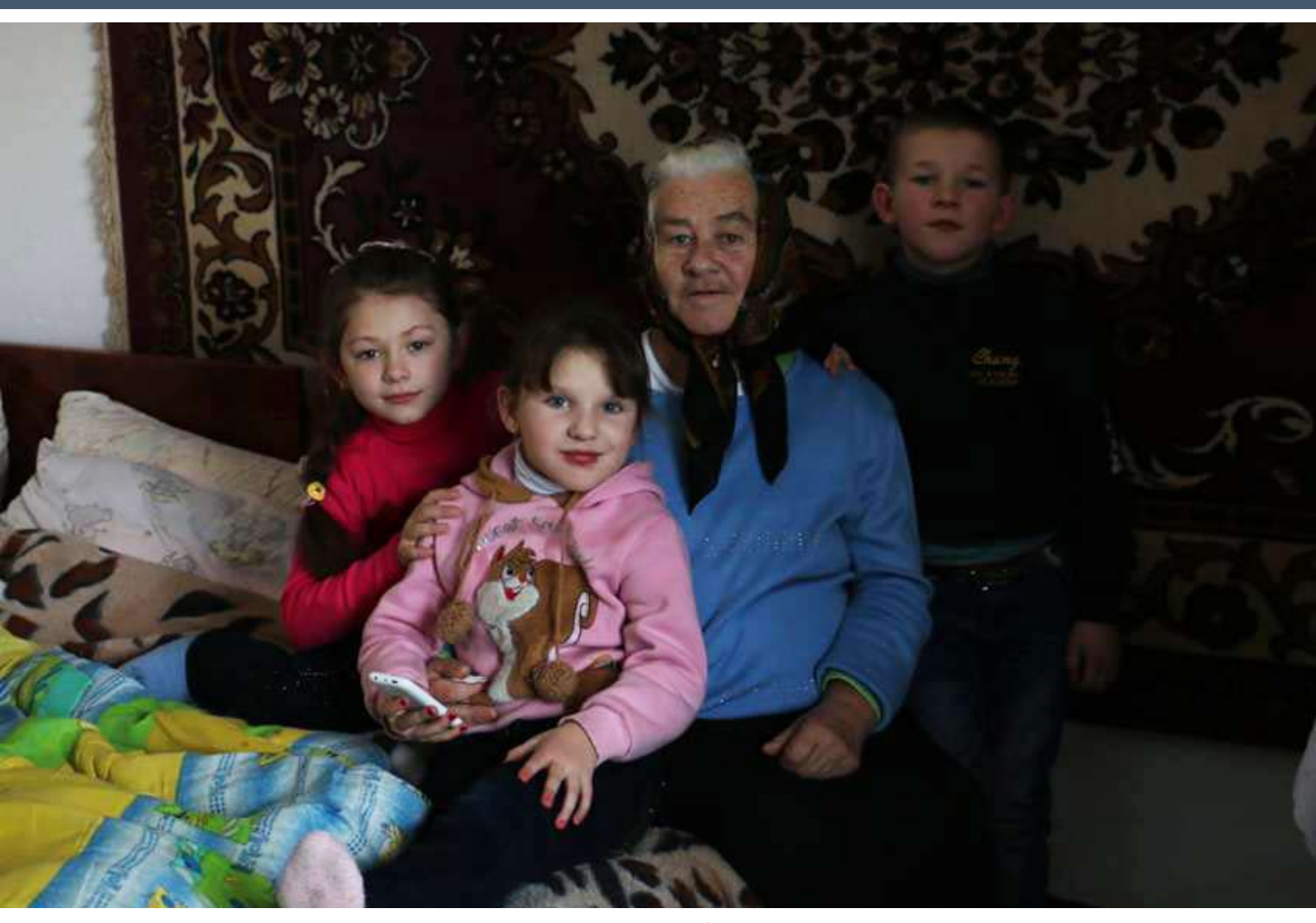
Children with great-grandmother at funeral Skole, Ukraine

I have been lucky enough to travel quite a bit within Ukraine as well, focusing mostly on rural areas. Thanks to a generous loan from Canon I have been able to photograph and video many of my experiences. I have witnessed everything from the first day of school to a village funeral. I've met with volunteer battalion members on Maidan, visited an incredible orphanage in Ternopil, filmed the arm-wrestling champion of the world in Kremenets and had an educational and enjoyable time test shooting the Canon C100 with a local photographer in Lviv. I've experienced a truly rural Christmas filled with rituals and deep beliefs. In all, Ukraine has not been without its adventures, all of which have informed me and have positively changed me.